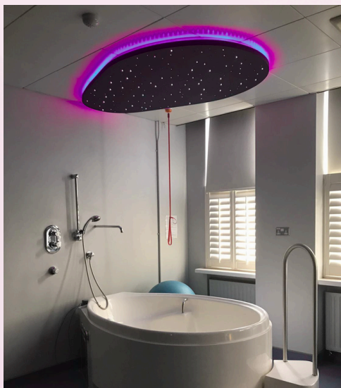
BIRTH POOL SHAPED

The ceiling panel can also be selected in a different colour.