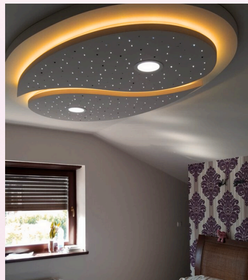
YIN & YANG SHAPED